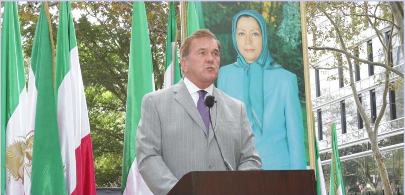
Former Homeland Security Secretary Tom Ridge Speaking