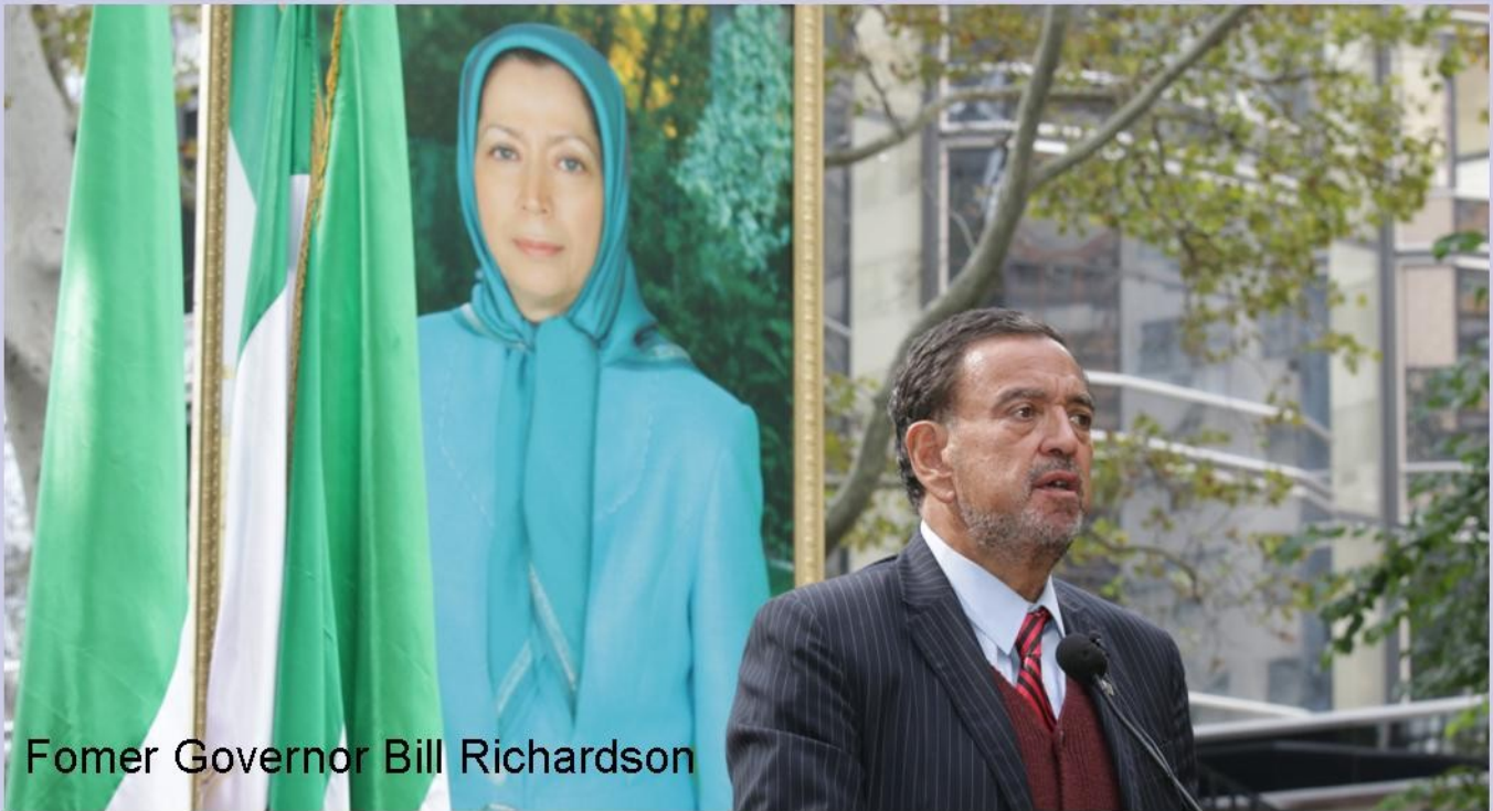
Fomer Governor Bill Richardson