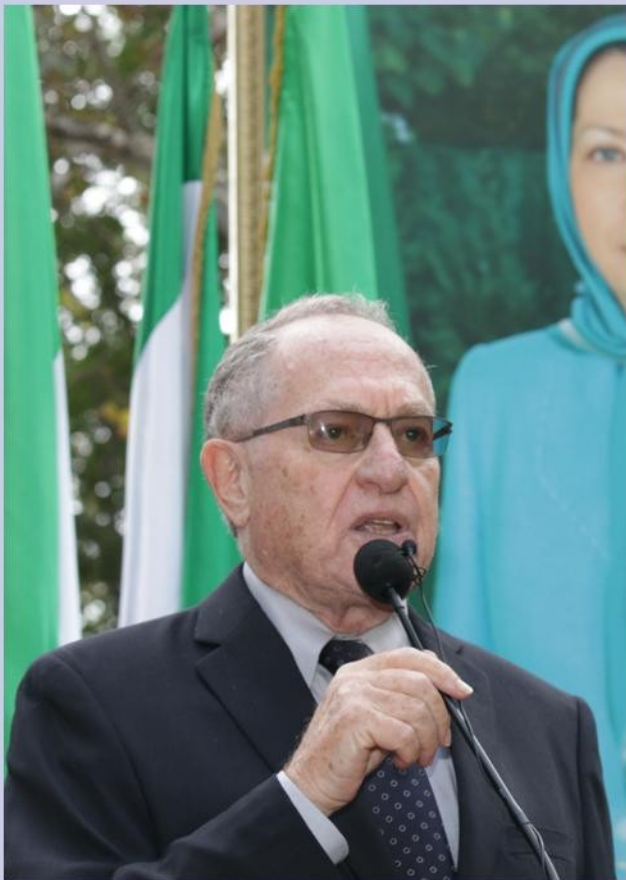
Alan Dershowitz, Popular Criminal Lawyer