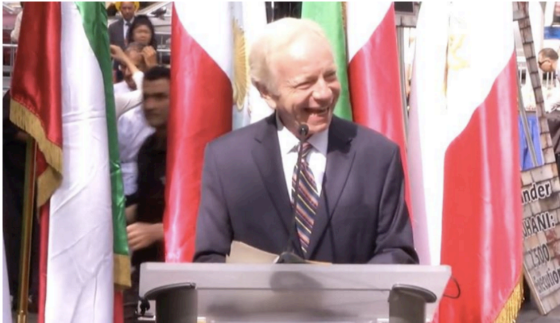
Senator Joe Lieberman was another honorary guest whose speech focused on the two-faced nature of supposed moderate president Hassan Rouhani.

“The fact is that the regime in Iran has more blood on its hands than even the regime in Pyongyang, so we say to the United Nations, don’t be fooled by Rouhani’s smile. And anyway he’s simply a puppet for Khamenei and the IRGC. It is time my friends for a change. It’s time for a change.”