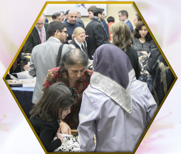
Iranian New Year "Nowruz" Celebration