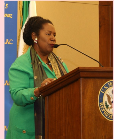
Rep. Sheila Jackson Lee

I look forward to join the Iran Human Rights and Democracy Caucus. Camp Liberty residents (MEK) put their lives on line to expose Iran nuclear site, and how we thank them? Camp Liberty is unprotected and its people live in a bad condition, ... We have to demand their protection and their human rights, this is the least we can do for them.... The world would have been a lot safer, if the sanctions that we passed in the nineties would have got imposed then, and today the whole world would not be in fear what Ayatollahs and atom bomb may do together.