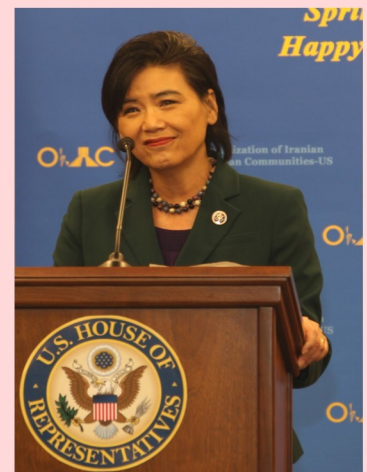
Rep. Judy Chu