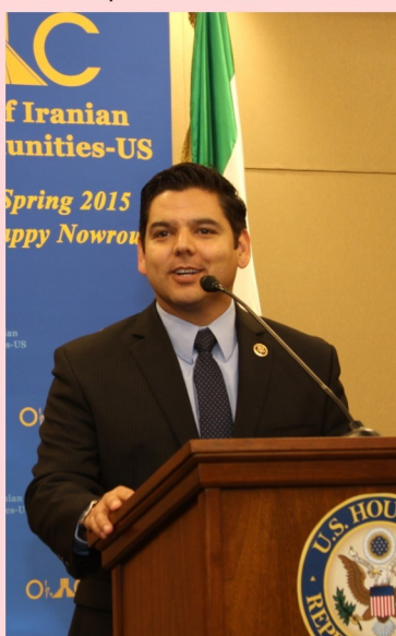
Rep. Raul Ruiz