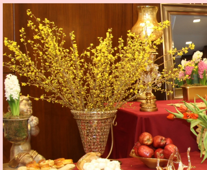
Iranian Nowrouz Table (Haft-Seen)