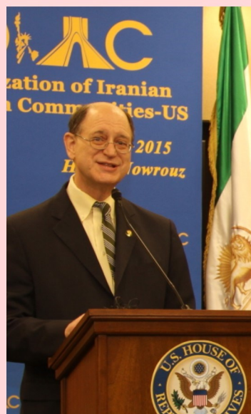
Rep. Brad Sherman