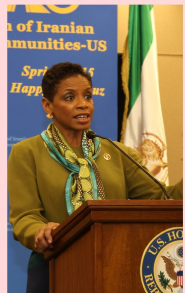
Rep. Donna Edwards