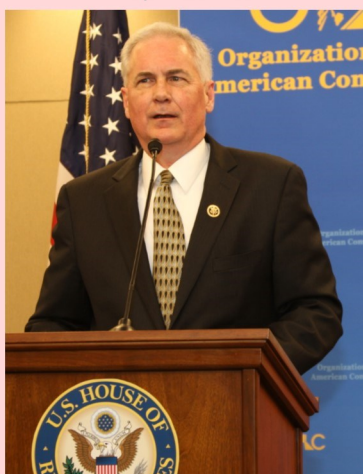
Rep. Tom McClintock