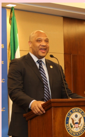
Rep. Andre Carson