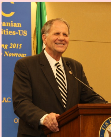
Rep. Ted Poe